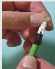
5) Push fit housing to complete