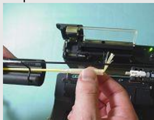
4) Assemble Heat Shrink