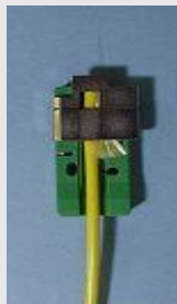
2) Prepare Fibre