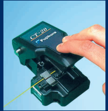
ONE - Action Cleaving